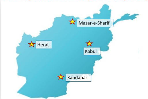
Cities in Afghanistan where Pax Populi is currently working

In 2014, our work in Afghanistan was entirely focused on working with students in two cities: